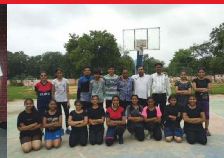
U-19 Basketball Girls Team- District Level Champions Year 2017-18