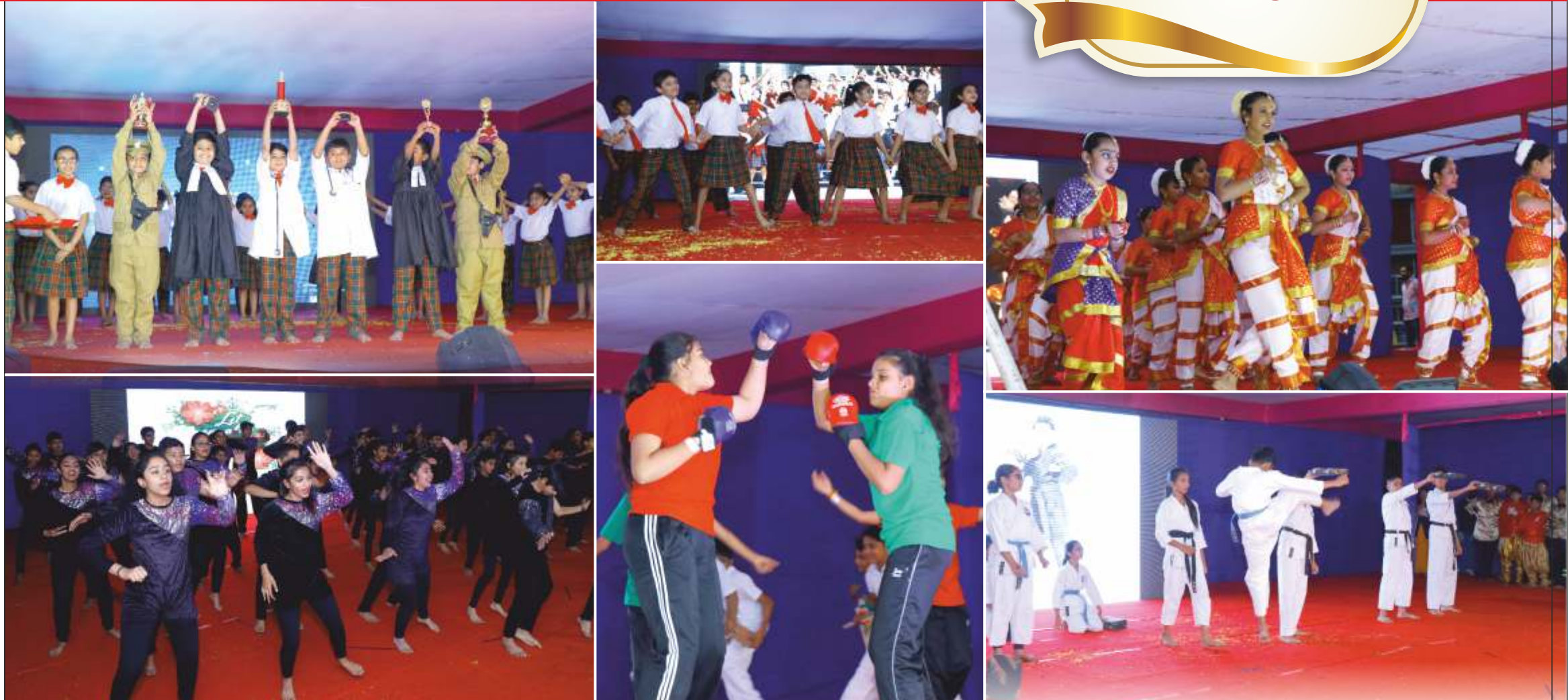
Showcasing Talents And Achievements

"It's generally said that a child learns from the lips and the lap of its mother. While that is unchallenged, the knowledge part is something that the school imparts to ensure a well rounded development. I certainly believe that my school played a massive role in helping me get to where I am. The days at school are still the best days I have ever spent. I wish the school, the teachers and the administrators the very best through this Coffee Table book initiative."