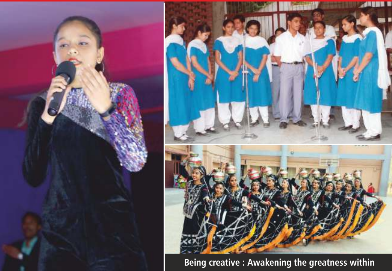
Being creative : Awakening the greatness within