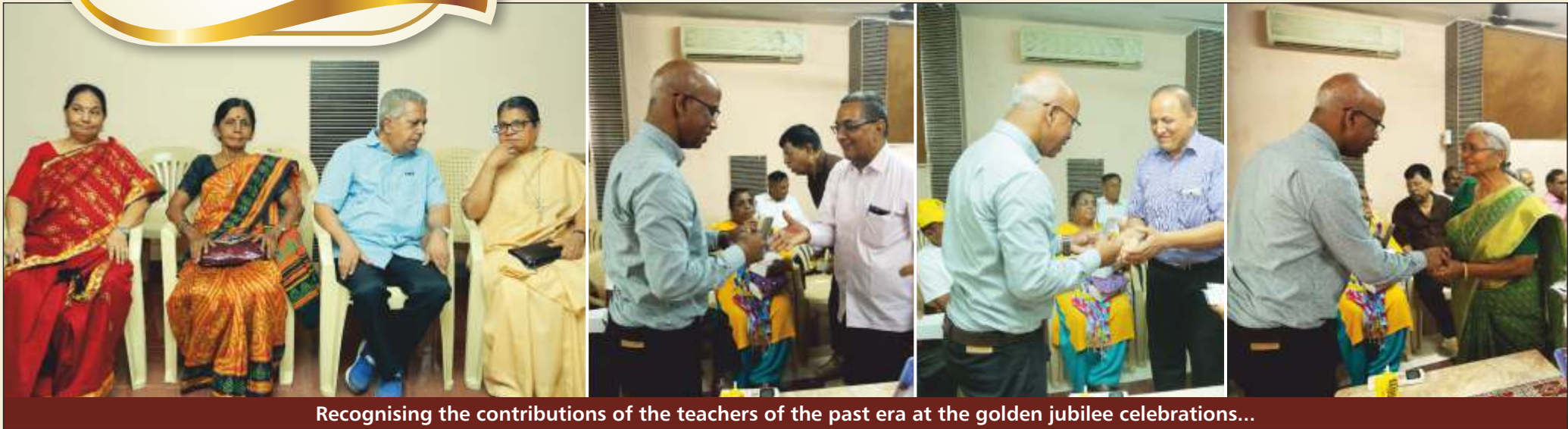
Recognising the contributions of the teachers of the past era at the golden jubilee celebrations...