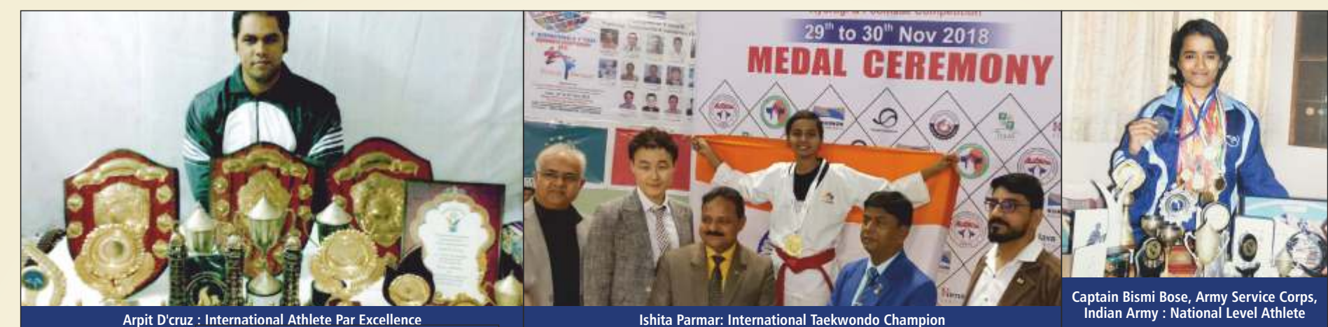
Arpit D'Cruz : International Athlete Par Excellence