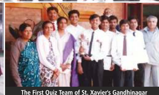
The First Quiz Team of St. Xavier's Gandhinagar