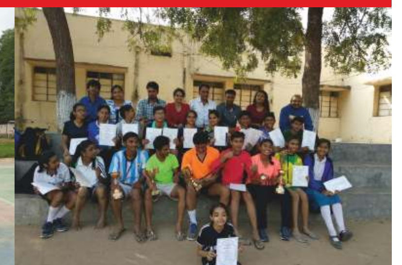
Friendship Games (Mehsana) U-17 Boys & Girls- Champions Year 2017-18