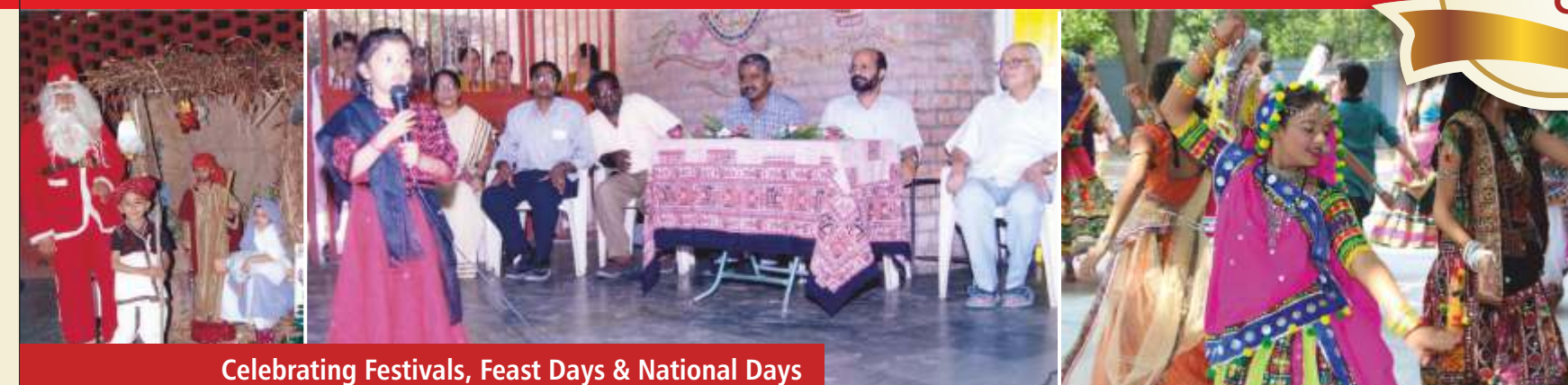
Celebrating Festivals, Feast Days & National Days