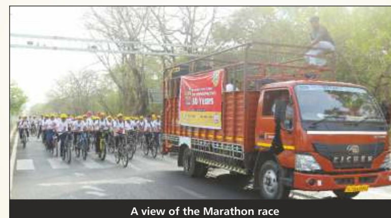
A view of the Marathon race