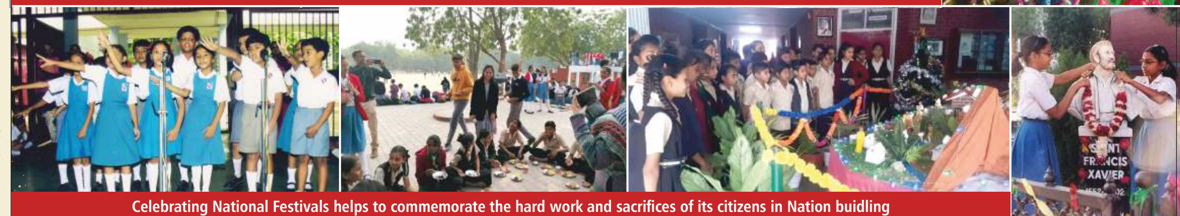
Celebrating National Festivals helps to commemorate the hard work and sacrifices of its citizens in Nation building