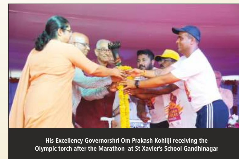
His Excellency Governorshri Om Prakash Kohliji receiving the Olympic torch after the Marathon at St Xavier's School Gandhinagar

Cultural programme at the inauguration of the Golden Jubilee Celebrations