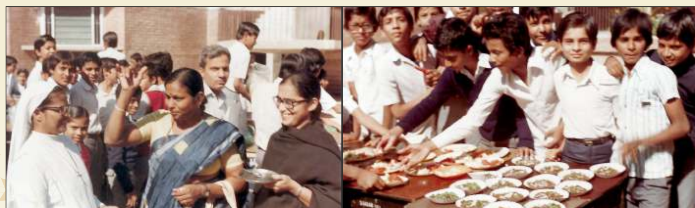
Canteen Day contributions for the underprivileged