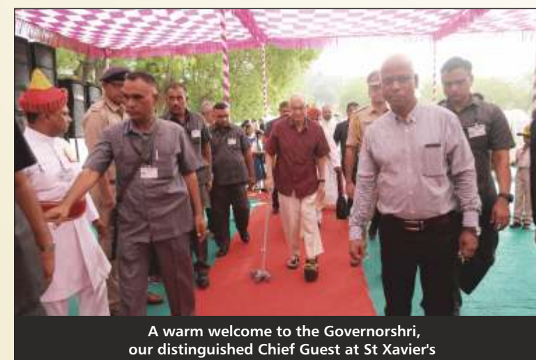
A warm welcome to the Governorshri, our distinguished Chief Guest at St Xavier's