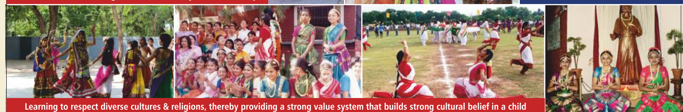
Learning to respect diverse cultures & religions, thereby providing a strong value system that builds strong cultural belief in a child