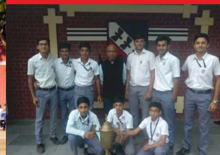
Hill Shield Cricket Tournament, Gandhinagar- District Level Champions Year 2018-19