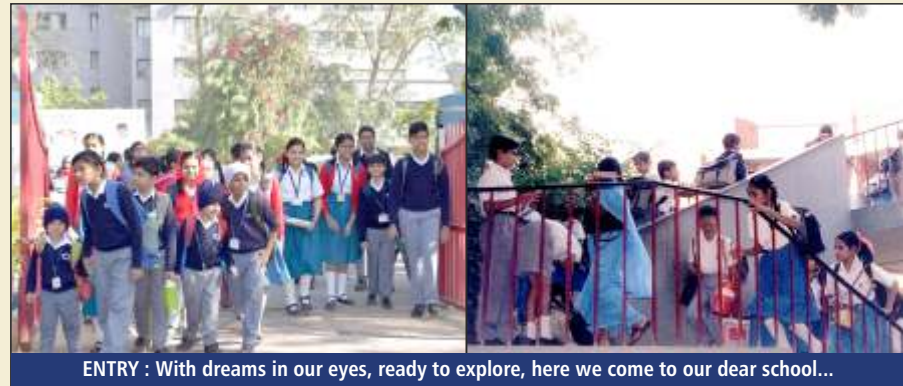
ENTRY : With dreams in our eyes, ready to explore, here we come to our dear school...