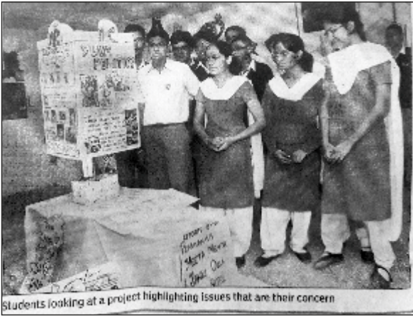
Students looking at a project highlighting issues that are their concern