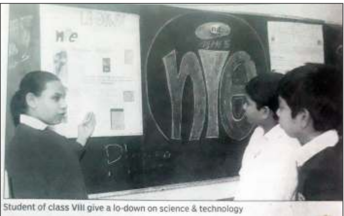
Student of class VIII give a lo-down on science & technology

NIE (Newspaper in Education) - NIE Times, the student edition of The Times of India contributes to value-added education that goes beyond textbooks and the curriculum.