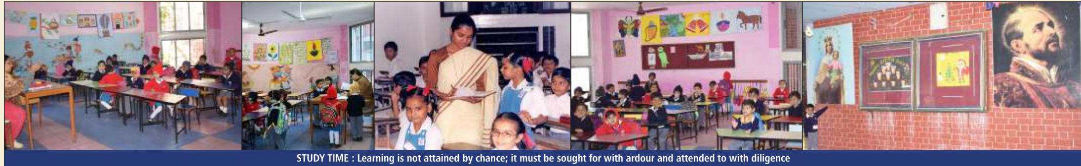
STUDY TIME : Learning is not attained by chance; it must be sought for with ardour and attended to with diligence