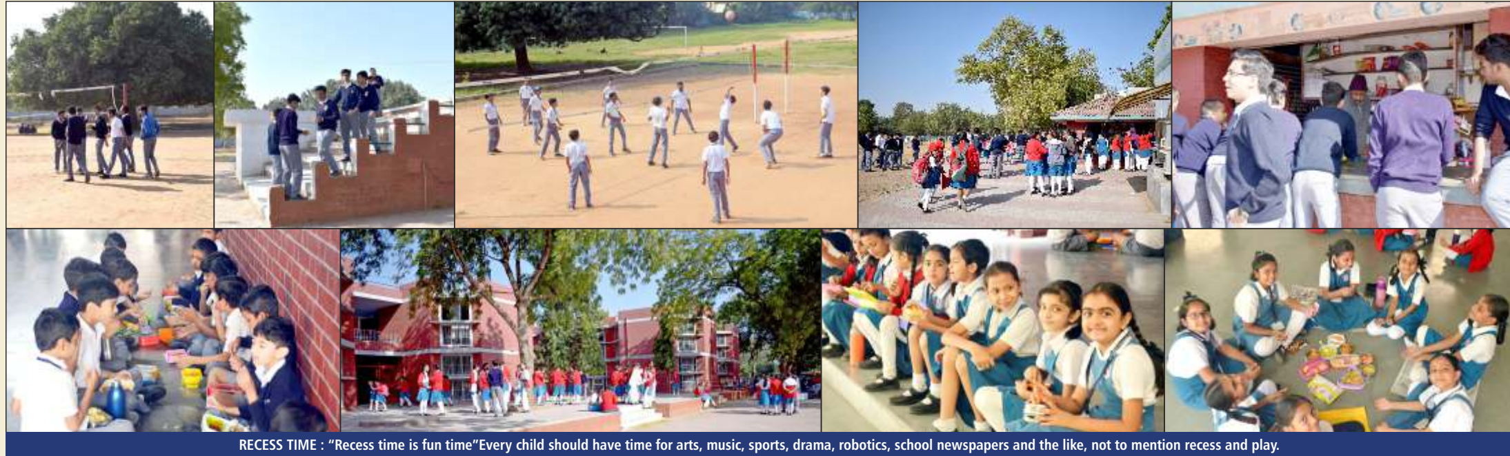
RECESS TIME : "Recess time is fun time"Every child should have time for arts, music, sports, drama, robotics, school newspapers and the like, not to mention recess and play.