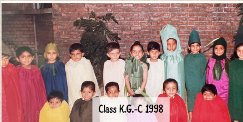
Class K.G.-C 1998

Writing an article for VoX feels like a lifetime opportunity, as I've also been a part of the team to make VoX at some point. The word "St. Xavier's" invokes excitement as something always happens in the school. You have celebrations of Teacher's day, Republic Day, Independence Day, science exhibitions, and quizzes! (best thing I remember!), Football tournament (that Adrenaline rush!), Basketball tournament, chess, carrom, sports day, Diwali celebration, Christmas celebration, and the list would not exhaust. No other place can provide you with such opportunities to explore yourself from a young age. I miss Football tournaments and the Annual Day celebration. Those days would never come; I won't be on the school team again. A little sad, but those are my beloved memories.