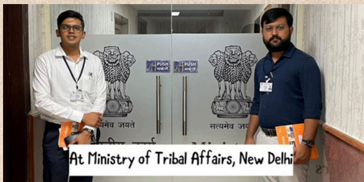
At Ministry of Tribal Affairs, New Delhi