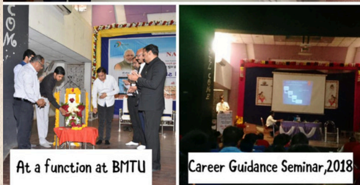
At a function at BM TU